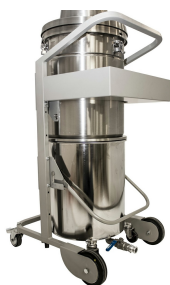
Mini Enhanced - Rear View