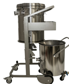
Mini Enhanced - Side View with detachable tank