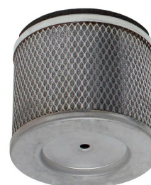
Coalescing HEPA filter (Upstream) - Included