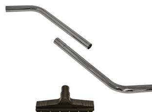
Optional 3D Tools