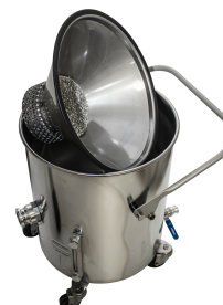
Cone assembly and detachable recovery tank with liquid level indicator and drain valve - Included