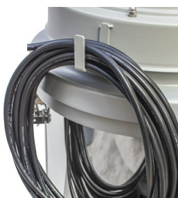
Cable Holder Hook included on the side of the powerhead