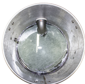
Conductive "wet" recovery bag - Included