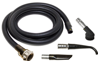
3D Tool Kit for 1.5" camlock suction inlet - included