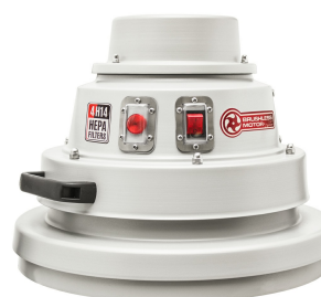
Longer Life Brushless Motor Available (always with 4 x H14 HEPA filters)