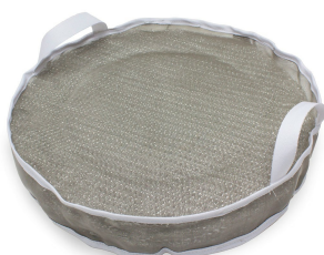
Mist Arrester Pack - Included